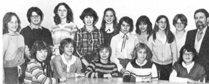
Drama Club - Grades 7-8