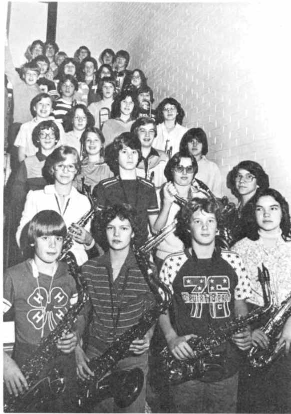
Jazz Band - Grades 7-8