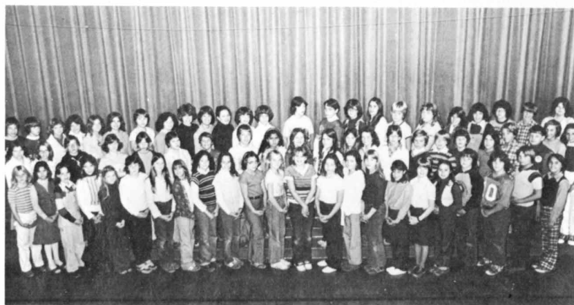
Choir - Grade 6