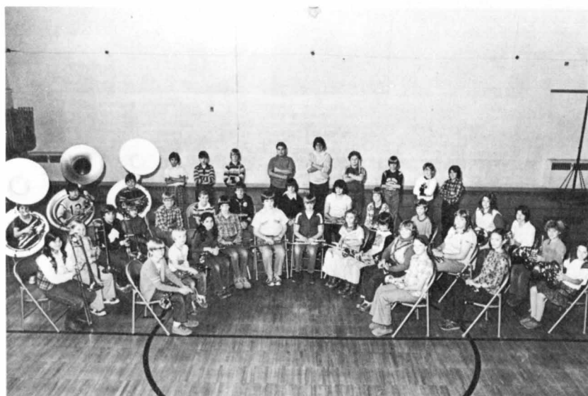
Beginners' Band - Grades 5-6