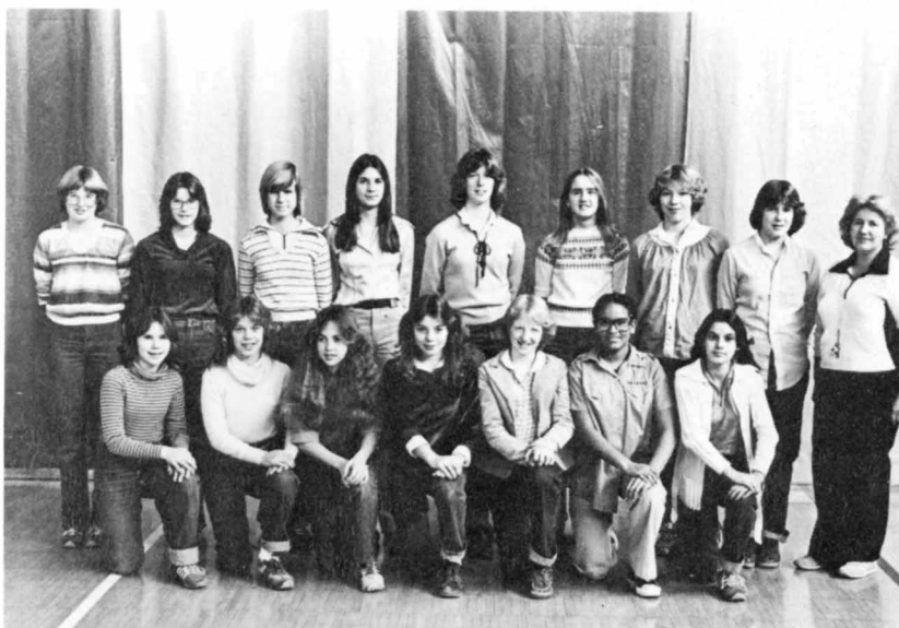
Intramurals - Grades 7-8