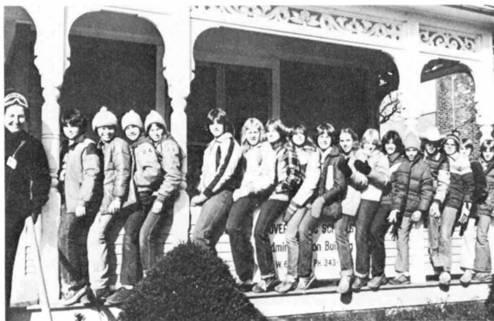
Ski Club - Grades 7-8