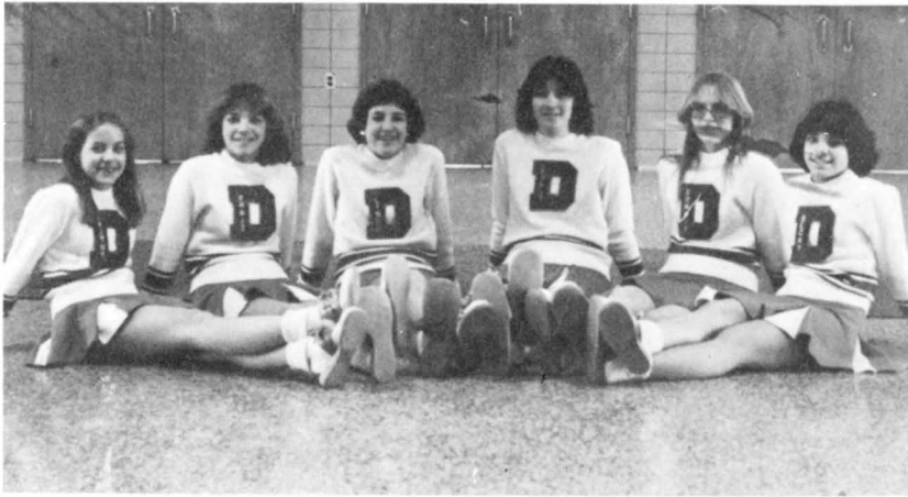
Football Cheerleaders - Grades 7-8