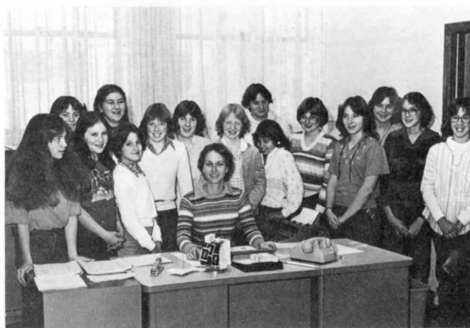
Guidance Assistants - Grades 7-8