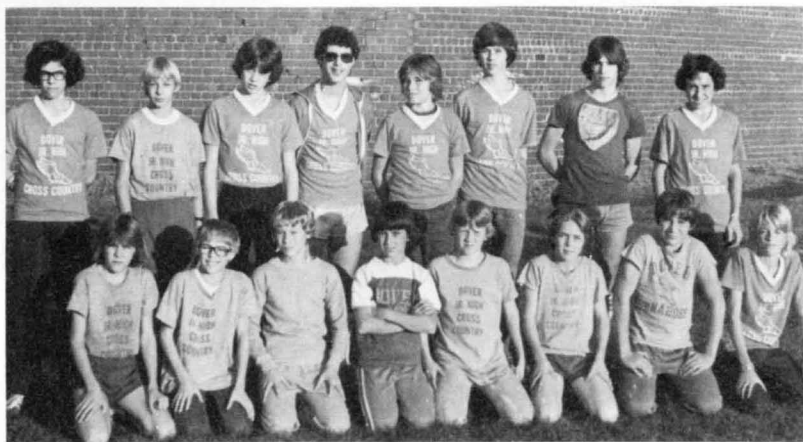
Cross Country - Grades 7-8