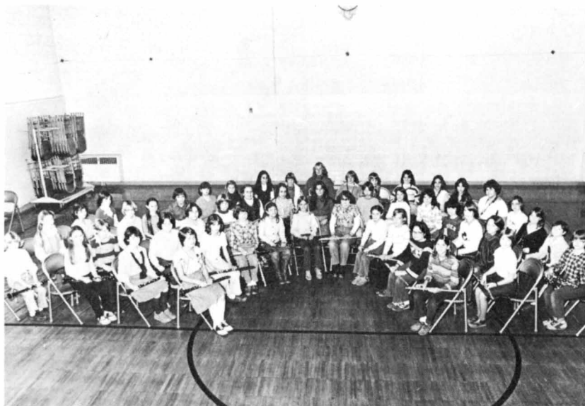
Beginners' Band - Grades 5-6