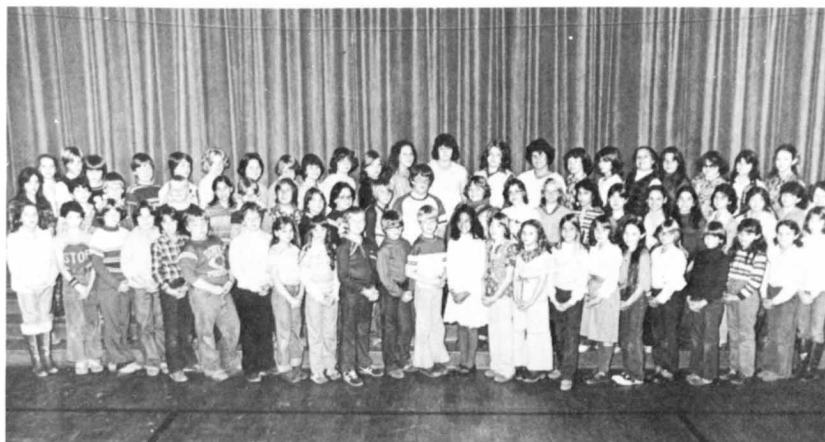
Choir - Grade 5