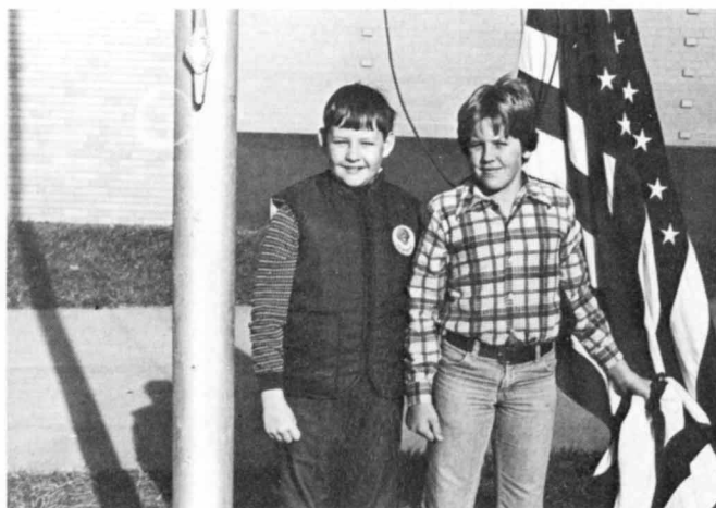
Flag Boys - Grades 5-6