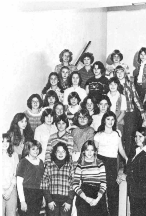
Horse Club - Grades 7-8