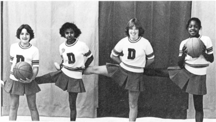
Basketball Cheerleaders - Grade 7