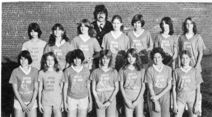
Cross Country - Grades 7-8