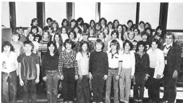
Choir - Grade 7