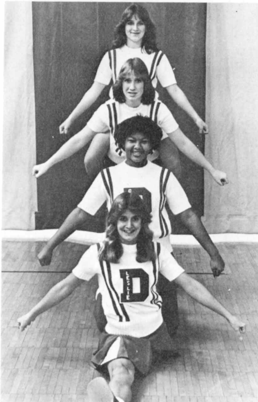
Basketball Cheerleaders - Grade 8