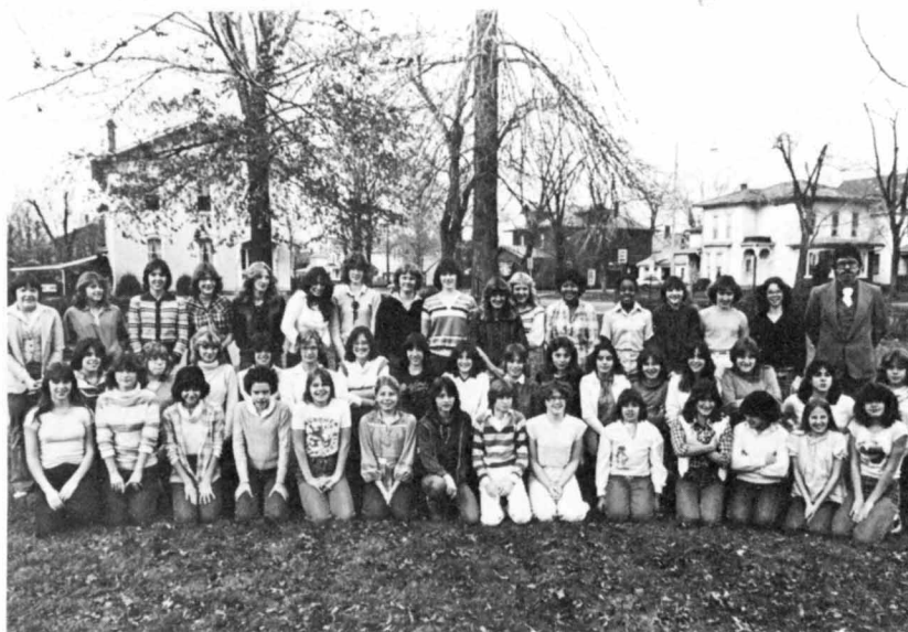
Track - Grades 7-8