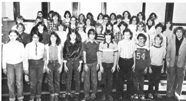
Choir - Grade 8