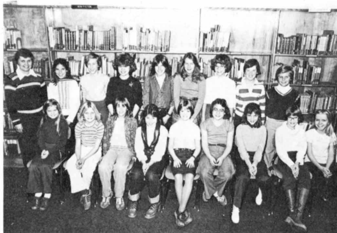
Student Librarians - Grades 5-6