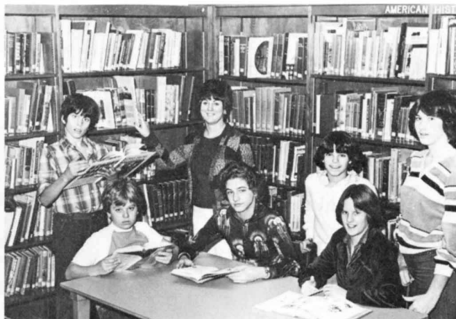
Student Librarians - Grades 7-8