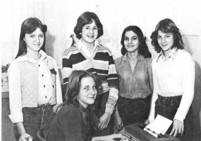
Office Assistants - Grades 7-8