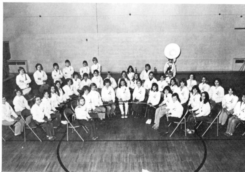
Park Middle School Band - Grade 6