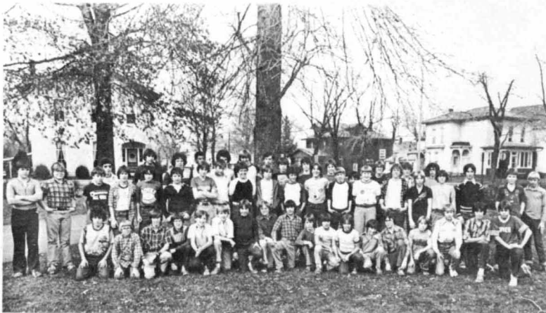
Track - Grades 7-8